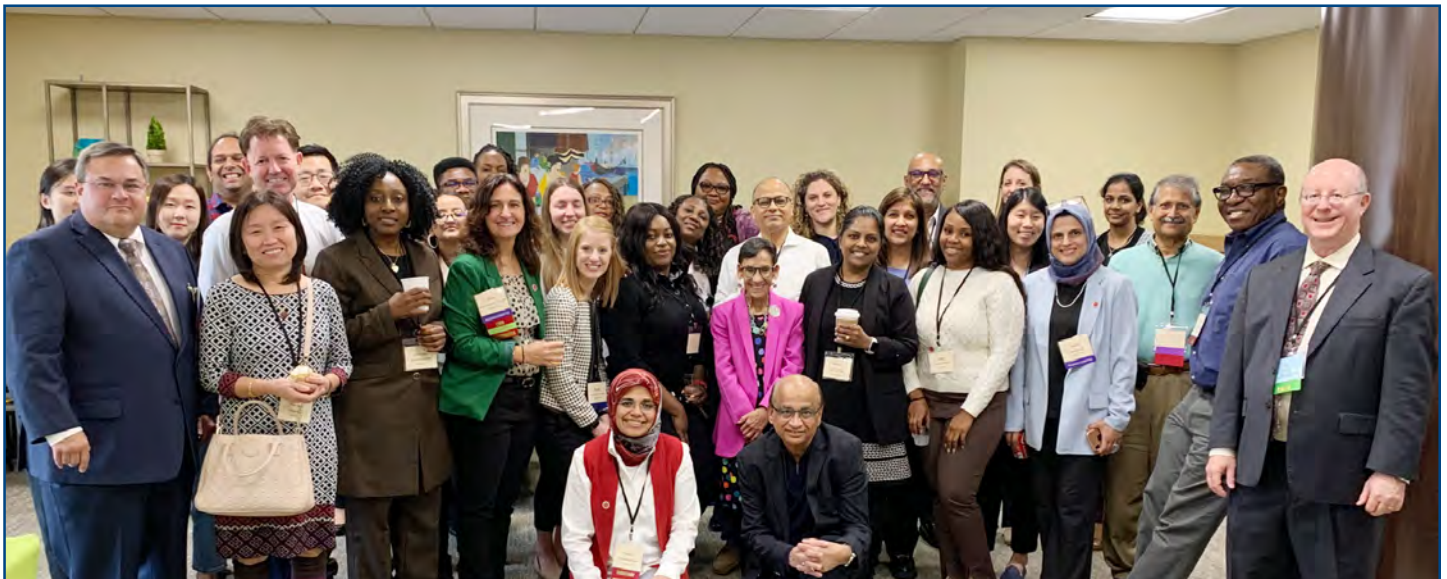
MMDA's 30 th Anniversary Conference was held on Nov. 4, 2023, at the Hebrew Home of Greater Washington, and it was a huge success. Pictured here are some of the participants during the conference.